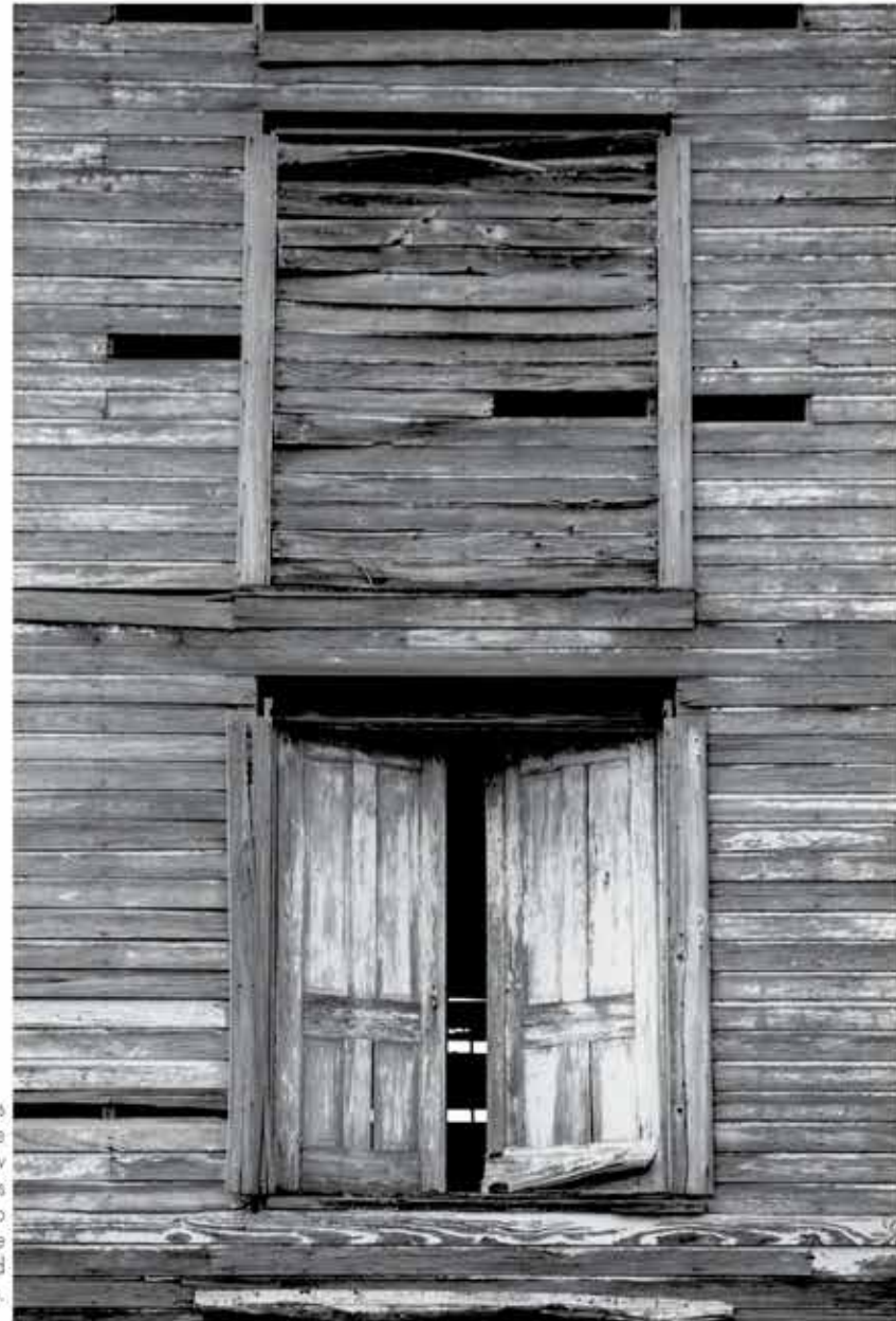
TITLE: NEGATIVE SPACE LOCATION: FT. VALLEY, GA

(to the right) Using elements of framing creates a static composition here. The rich texture of the weathered wood creates a nice contrast as a b&w photograph. The negative space between the doors bisects the frame. This directs your eye upward to notice the missing boards, adding balance to the space. Furthermore, the upside-down crosses found in the doors presents religious overtones.