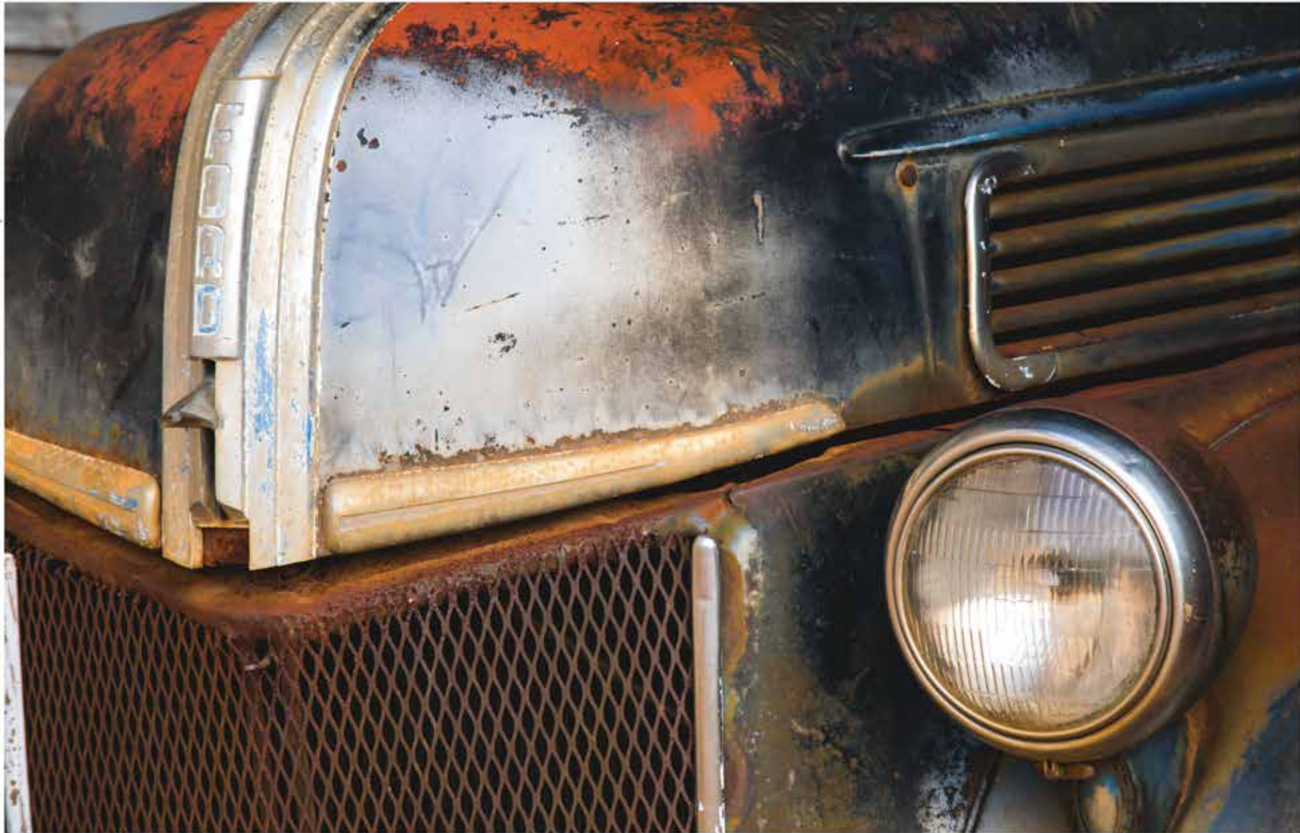
TITLE: FORD LOCATION: FT. VALLEY, GEORGIA

On my travels home from Savannah, GA I encountered an old barn for farming equipment & machinery. There I found this rustic, vintage model ford. It serves as an homage to its past & insight to the future. The classic forms, of the popular model are found in the headlights & shape of the grill. Additionally, the hood demonstrates elements of streamlining found in the 1930-1950's.