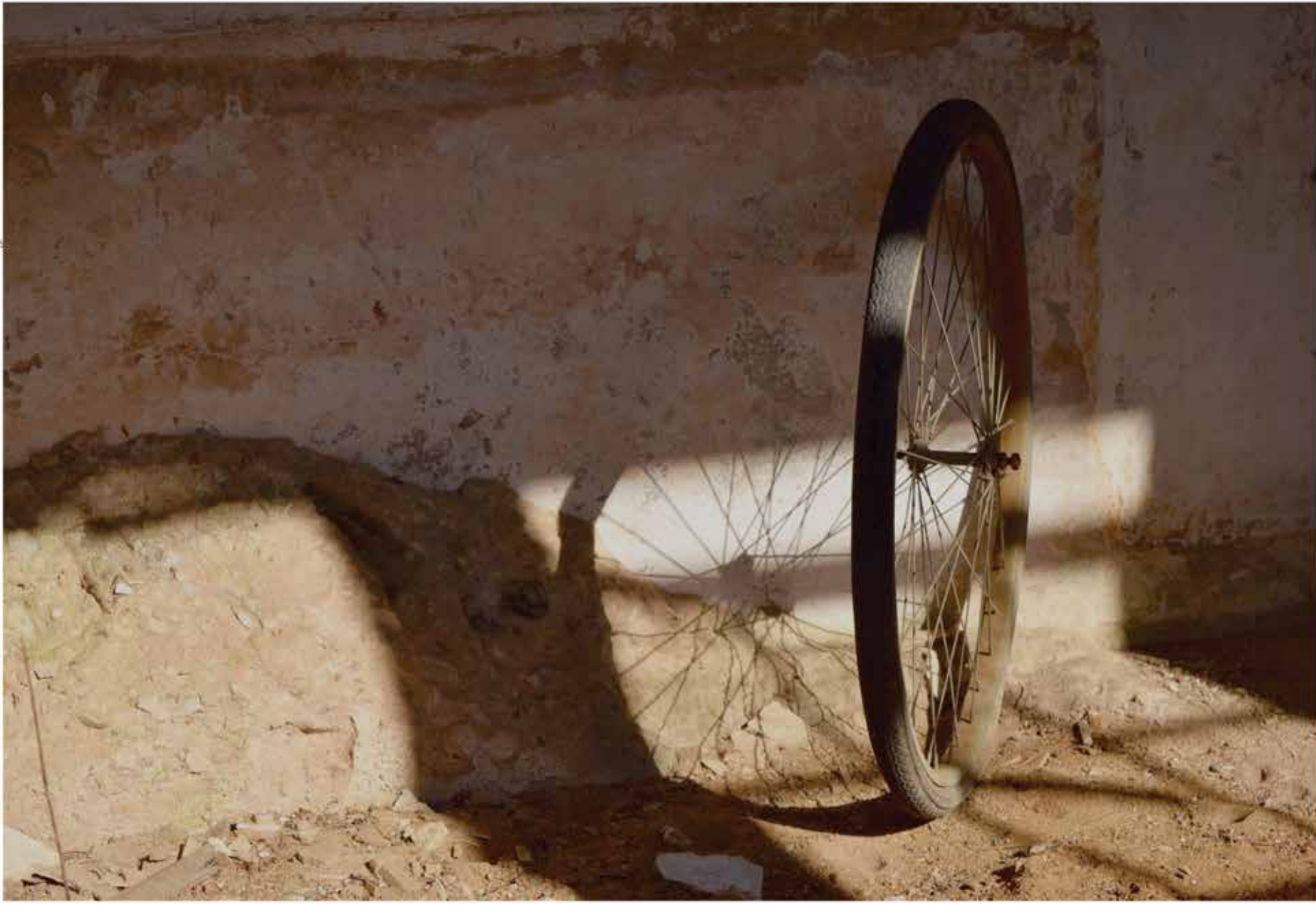
TITLE: THE WHEEL LOCATION: ALBURN, ALABAMA

This photograph was taken inside an abandoned milking barn. It reiterates the theme of mass industrialization. The wheel, a symbol of human progress & social advancement, is rusted & worn. Ironically, its purpose has been forgotten, neglected, & outdated. The way the light exposes the tread's tapered condition while simultaneously playing with the light by casting shadows of the spokes & window grids provides a strong composition.