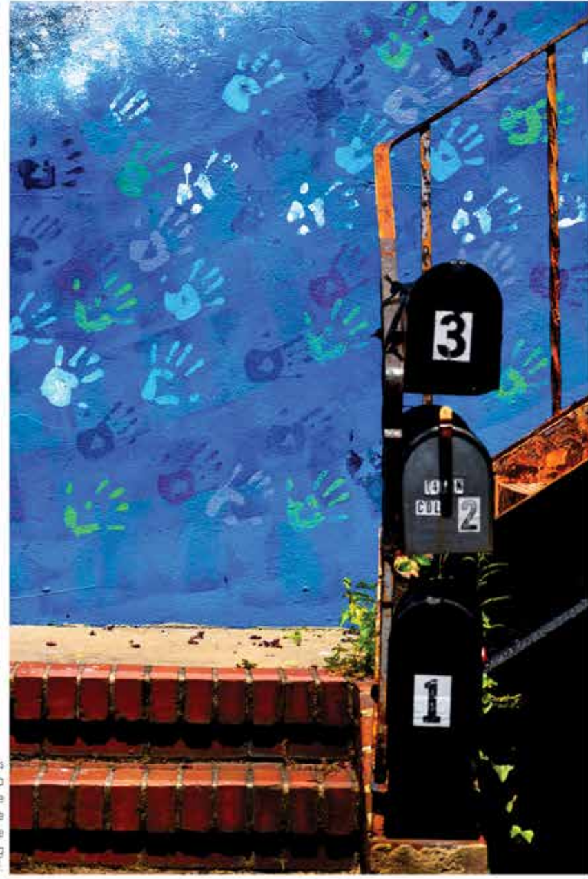
TITLE: RED, YELLOW, & BLUE LOCATION: GENEVA, AL

(to the right) The use of the rule of thirds creates a strong composition. There is a theme of progress. The hand prints evoke a child-like quality. This emphasizes the idea that "children are the future". The mailboxes aligned vertically representing the stages of adulthood.